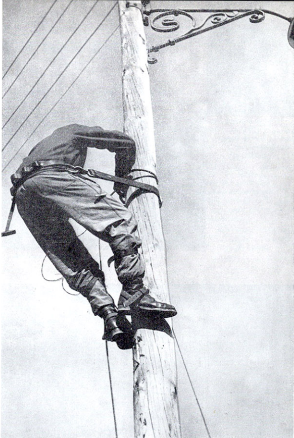
Working at giddy heights keeps the communication lines of the Division open

The Division signal supply section is divided into three sub-sections: (1) repair and maintenance; (2) photographic; (3) signal supply.